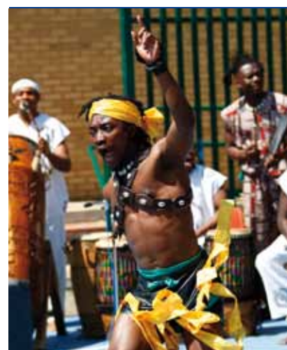
Our second International Day was held for residents of Fryerns and Craylands in May.