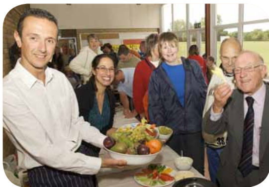
Healthy Eating Display

The Swan Foundation is a new charitable arm of Swan that was officially registered in October 09 at the House of Lords in Westminster.