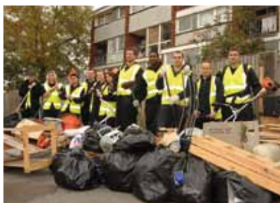
Our Environment Action Day in Basildon saw 4 skips of rubbish and 8 vehicles of garden waste removed.