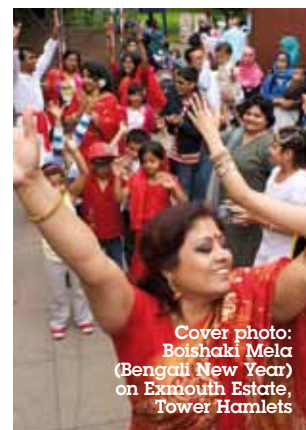
Cover photo: Boishaki Mela (Bengali New Year) on Exmouth Estate, Tower Hamlets