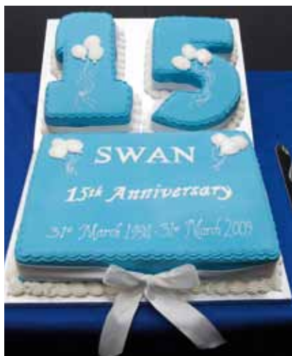
We celebrated our fifteenth year since formation.