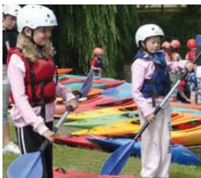
We ran a summer programme of activities for young residents, it included art, sports and visits to London landmarks.