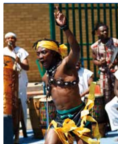
Our second International Day was held for residents of Fryerns and Craylands in May.