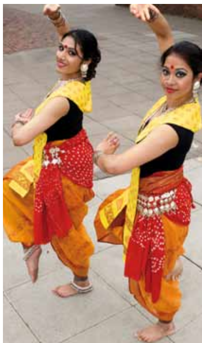
Residents enjoyed music, dancing, singing and story telling at the Boishaki fun day on the Exmouth Estate in June.