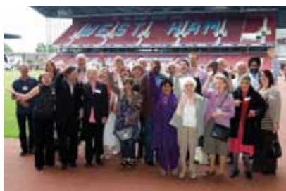
There was a good attendance at this year's Residents' Conference held at West Ham's football ground.